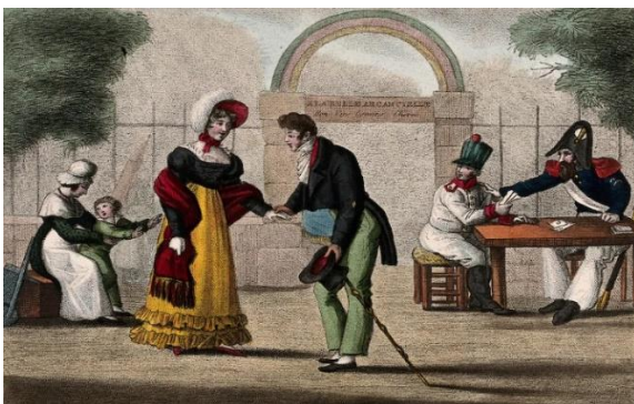
The handkerchief was once a token of love, such as between this lady and the soldier.

Wealthy people have used them to signify class and manners, and for discretely wiping away phlegm rather than smearing snot on sleeves or down skirts. Royalty have used them to indicate wealth and power through their gifts of fine linen and silk handkerchiefs to favoured subjects. Henry VIII owned an extensive collection, some embossed with gold and silver.