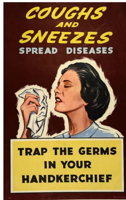
This 1960s poster from New Zealand urges us to use a hanky.

As long as you throw tissues away after using them, and don't leave them lying around for others to pick up, the chance of passing germs to others from a used tissue is far lower.