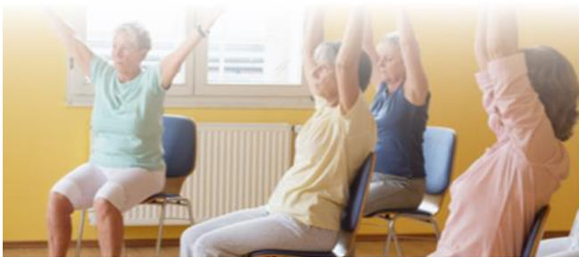
This program is run by Selah Yoga, thanks to funding from the Hunter New England and Central Coast PHN, and support from the Bingera Node of the Southern Queensland and Northern NSW Innovation Hub.