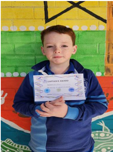
Captains Award - Preston