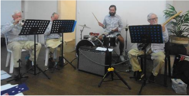
The Barraba Band plays the National Anthem

Opening entertainment and the National Anthem was provided once again by our very own Barraba Band.